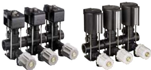
AA144A-3-3 (Three Unit)

Note: 23520 Throttling Valve not included. See page 104 for more information.