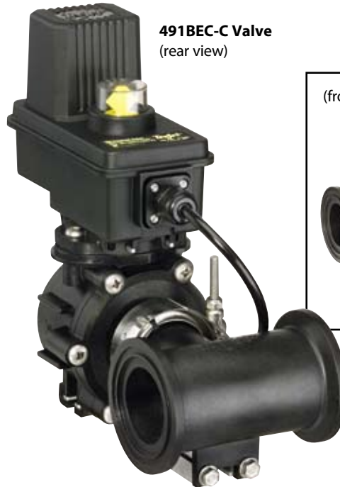
491BEC-C Valve (rear view)