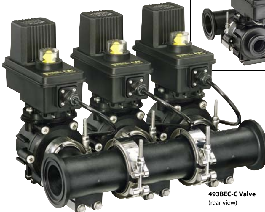
493BEC-C Valve (rear view)