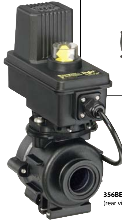
356BEC-C Valve (rear view)