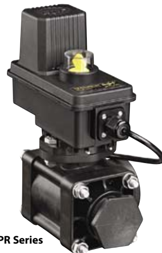
346 BPR Series