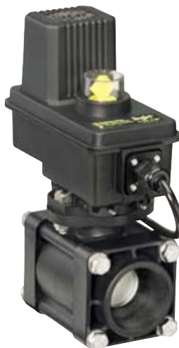
346 R Series