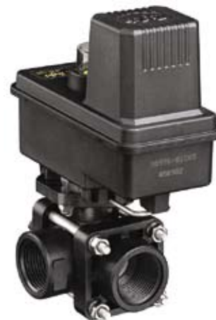
344 BPR Series