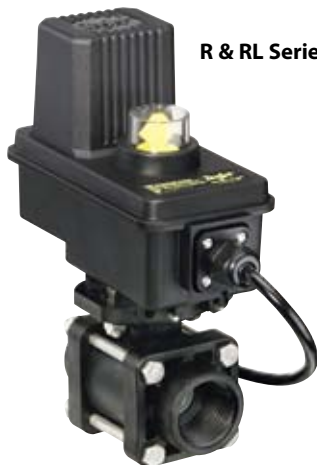
R & RL Series