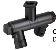
QJ8600-2-1/4-NYB Double Swivel Nozzle

QJ8600 swivel Quick TeeJet nozzle body assemblies provide the same spray tip adjustability of a standard TeeJet threaded swivel plus the quick change and self-aligning features of the Quick TeeJet System.