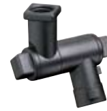
QJ8600-1/4-NYB Single Swivel Nozzle