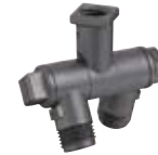
Type 8600-2 Nylon Double Swivel Nozzle