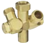
Type 5932 Double Swivel Nozzle 1/4" NPT female bottom outlet