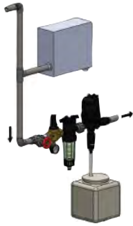
tank feed installation