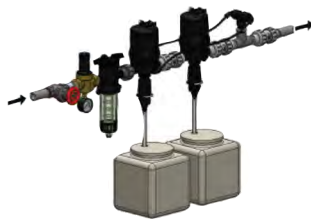
dual remote injection installation